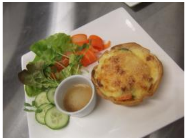
Chicken pies with salad and delicious mocktails – just some of Year. 11s culinary delights.