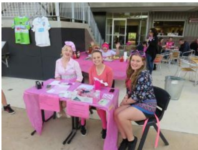
Coffees and cupcakes for pink day in the alfresco dining area served through the coffee window.